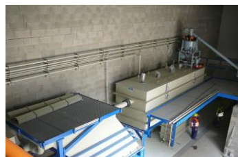
Chamber reactor/Lamella separator