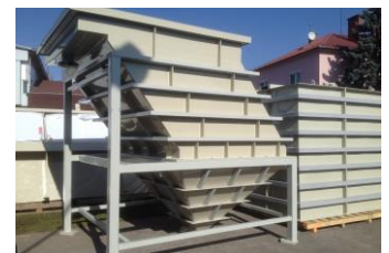
Chamber reactor/Lamella separator