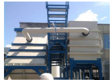
Reaction / Separation

Please see more information at www.wtc-macro.com